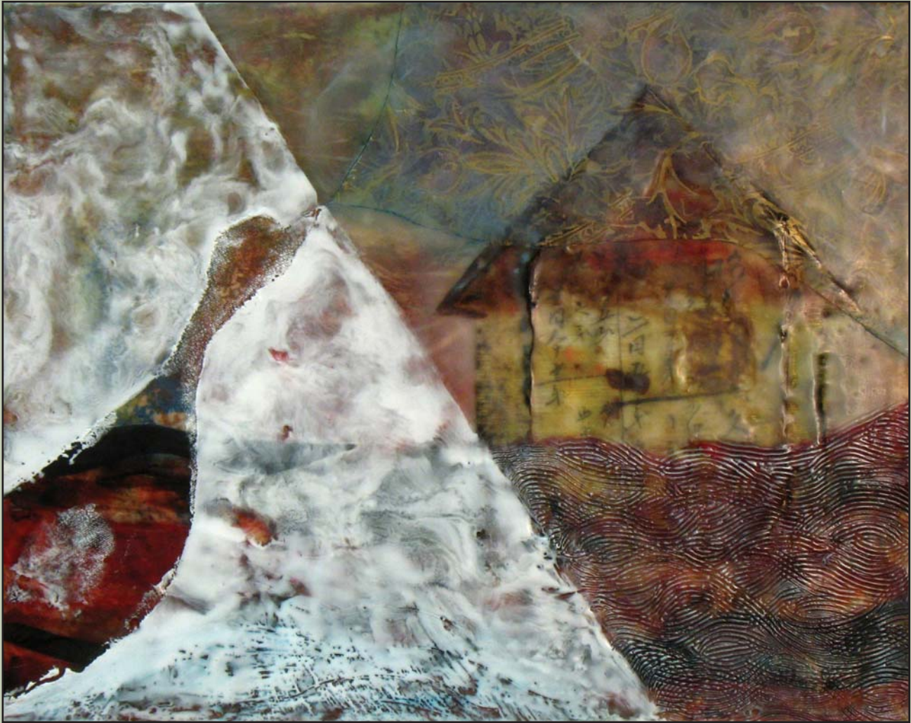
Linda Womack, Altering the Path

2007, Encaustic, hand made paper, material, oil paint, pastel on wood panel, 13" x 16"